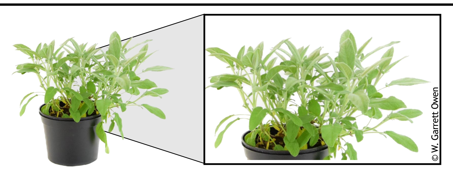
Figure 2. High substrate pH above 6.5 can inhibit iron (Fe) uptake causing chlorotic (yellow) foliage and stunted plant growth, but symptoms did not manifest during in University of Kentucky research trials with sage 'Berggarten' (Salvia officinalis).