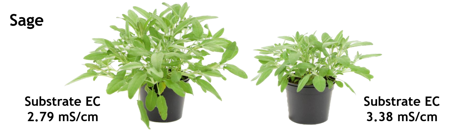
Figure 5. Overfertilization [high electrical conductivity (EC)] of sage 'Berggarten' (Salvia officinalis) can result in excessive or stunted plant growth. PourThru procedure determined sage plants with excessive plant growth (left) to have a substrate electrical conductivity (EC) value of 2.79 mS/cm, while plants with stunted plant growth (right) were found to have a substrate EC of 3.38 mS/cm.

Providing low fertility at 100 to 150 ppm N and maintaining a pH of 5.8 to 6.2 will help prevent most nutritional disorders.