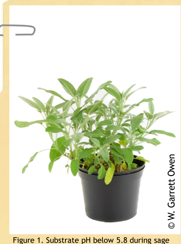
Figure 1. Substrate pH below 5.8 during sage 'Berggarten' ( Salvia officinalis ) production did not negative effect plant growth.