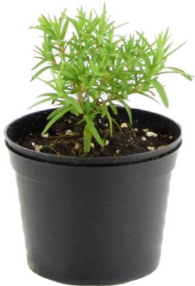
Figure 3. During rosemary ( Rosmarinus officinalis ) production, maintain low fertility levels of 100 to 150 ppm N. Higher fertility levels such as 200 ppm N can be adequate, but monitor substrate electrical conductivity (EC).