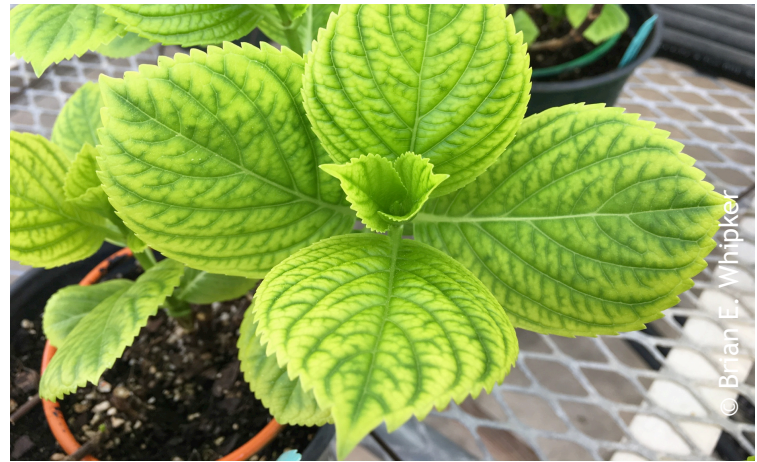
Figure 4. High substrate pH leads to interveinal yellowing (chlorosis) on the upper foliage.

Landis, H. and B.E. Whipker. 2017. Nutrient management strategies for ensuring blue coloration of greenhouse hydrangeas. e-GRO Alert 6-04, p. 6.