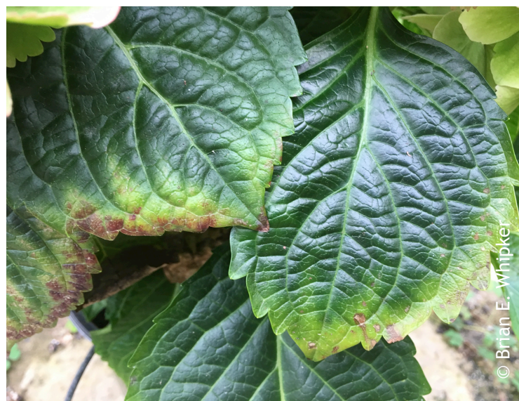
Figure 3. High soluble salts [referred to as electrical conductivity (EC)] due to an over-application of aluminum sulfate can lead to marginal leaf browning and death (necrosis).