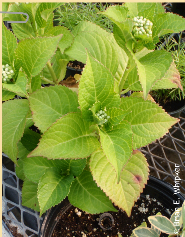
Figure 1. Low soluble salts [referred to as electrical conductivity (EC)] can result in lower leaf yellowing (chlorosis).