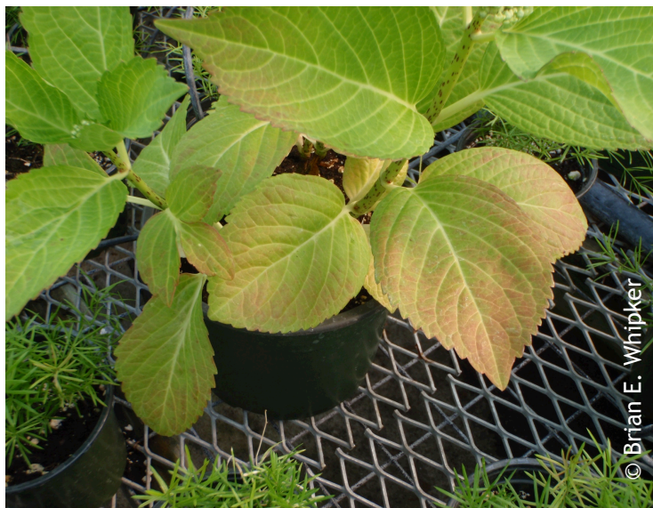
Figure 2. Low soluble salts [referred to as electrical conductivity (EC)] can also result in lower leaf reddening.