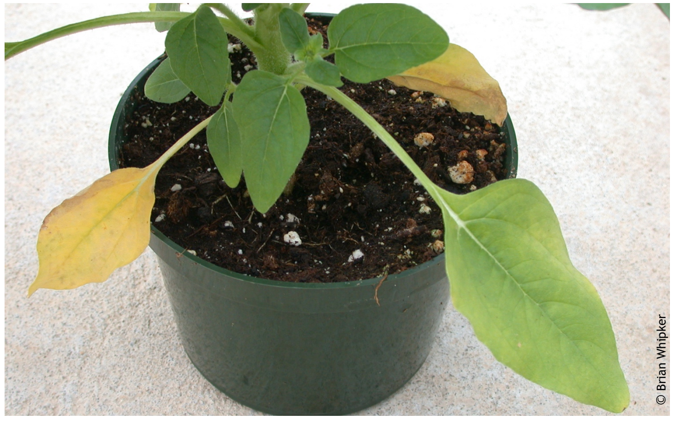
Figure 2. Providing insufficient fertility [low electrical conductivity (EC)] can result in lower leaf pale coloration and chlorosis (yellowing) of potted sunflower ( Helianthus annuus ).