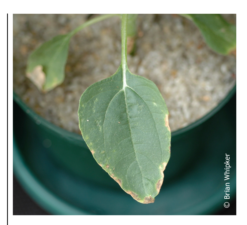
Figure 3. Excessive fertility [high electrical conductivity (EC)] during potted sunflower ( Helianthus annuus ) production can cause stunted growth and lower leaf necrosis (death).