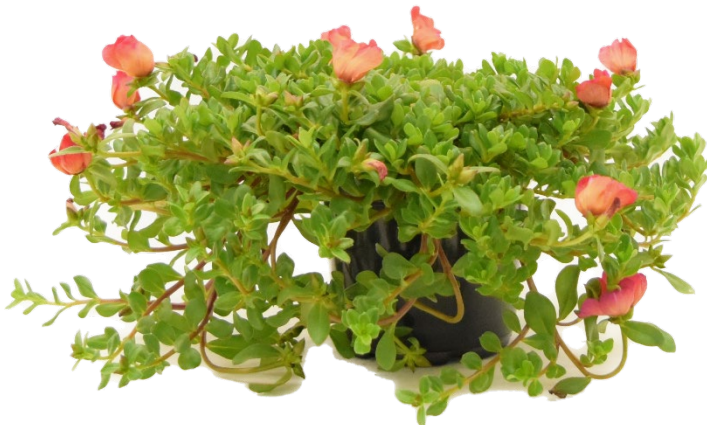
Figure 3. Substrate pH above 6.5 can stunt portulaca ( Portulaca oleracea ) plant growth without exhibiting interveinal chlorosis (yellowing).