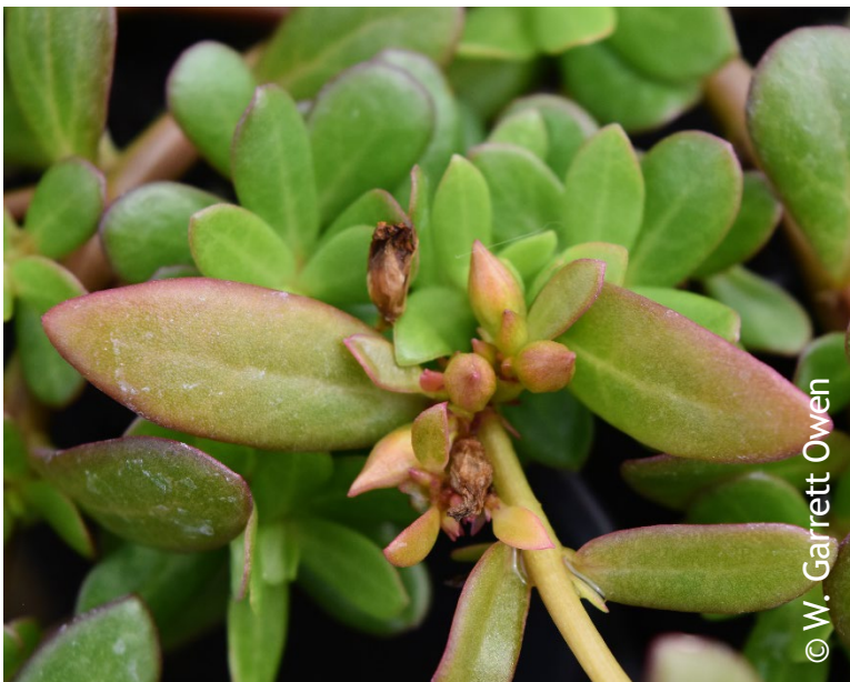
Figure 7. Providing insufficient fertility [low electrical conductivity (EC)] during portulaca ( Portulaca oleracea ) production can result in red leaves and leaf margins.