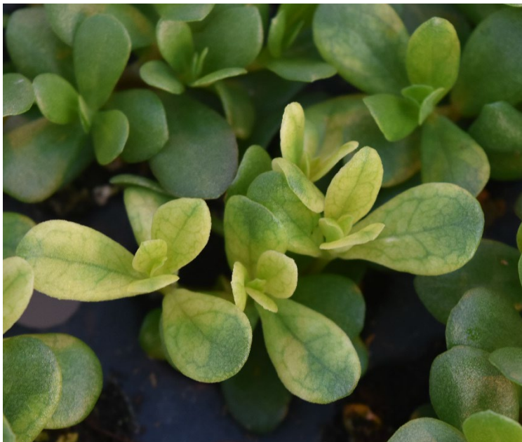
Figure 2. Substrate pH above 6.5 can cause portulaca ( Portulaca oleracea ) to exhibit interveinal chlorosis (yellowing).