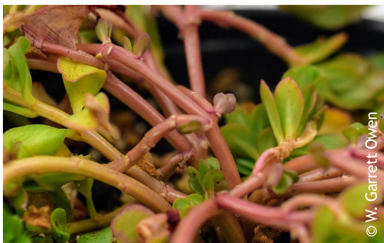
Figure 6. Providing insufficient fertility [low electrical conductivity (EC)] during portulaca ( Portulaca oleracea ) production can result in red stems.