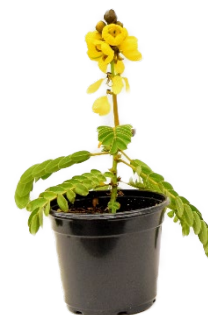
Figure 4. Providing insufficient fertility [low electrical conductivity (EC)] popcorn plant ( Cassia didymobotrya ) production can result in stunted plant growth.