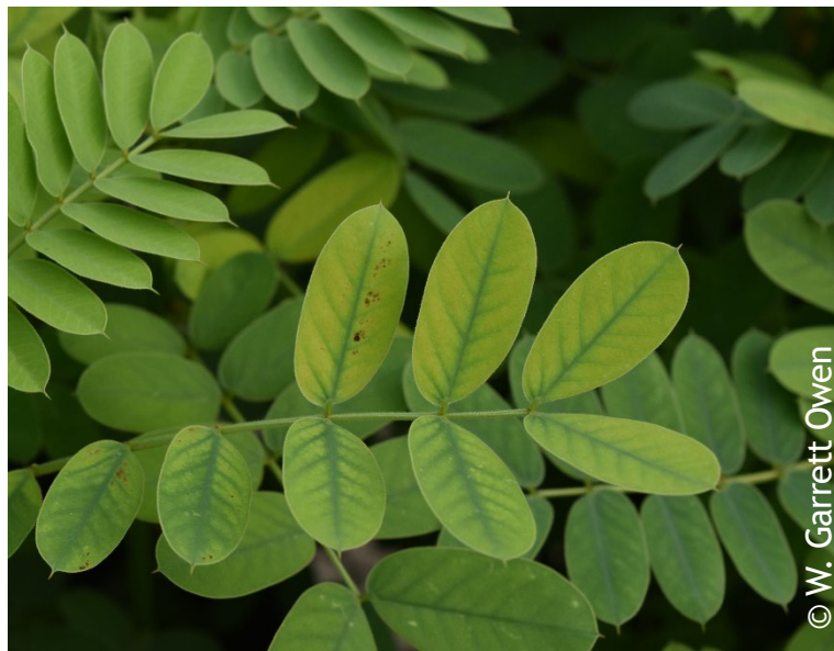
Figure 2. Substrate pH below 5.8 during popcorn plant ( Cassia didymobotrya ) production does not affect plant growth but may manifest black leaf spotting along the margins of leaflets.