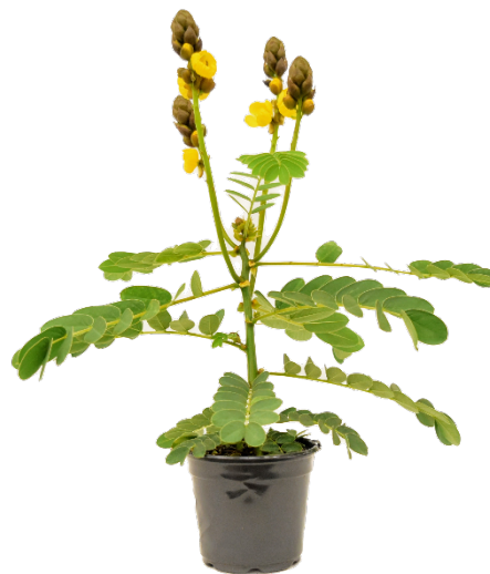
Figure 3. Substrate pH above 6.2 to 6.5 did not stunt growth of popcorn plant ( Cassia didymobotrya ) during research trials.

W. G. Owen thanks Raker-Roberta's for plant material; SunGro for substrate; and J.R. Peter's for fertilizer.